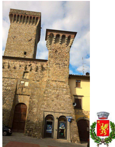
Rosini Theatre Lucignano

Conference, Lucignano (AR), 21-22 March 2016